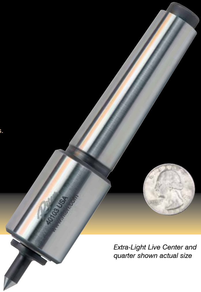
Extra-Light Live Center and quarter shown actual size